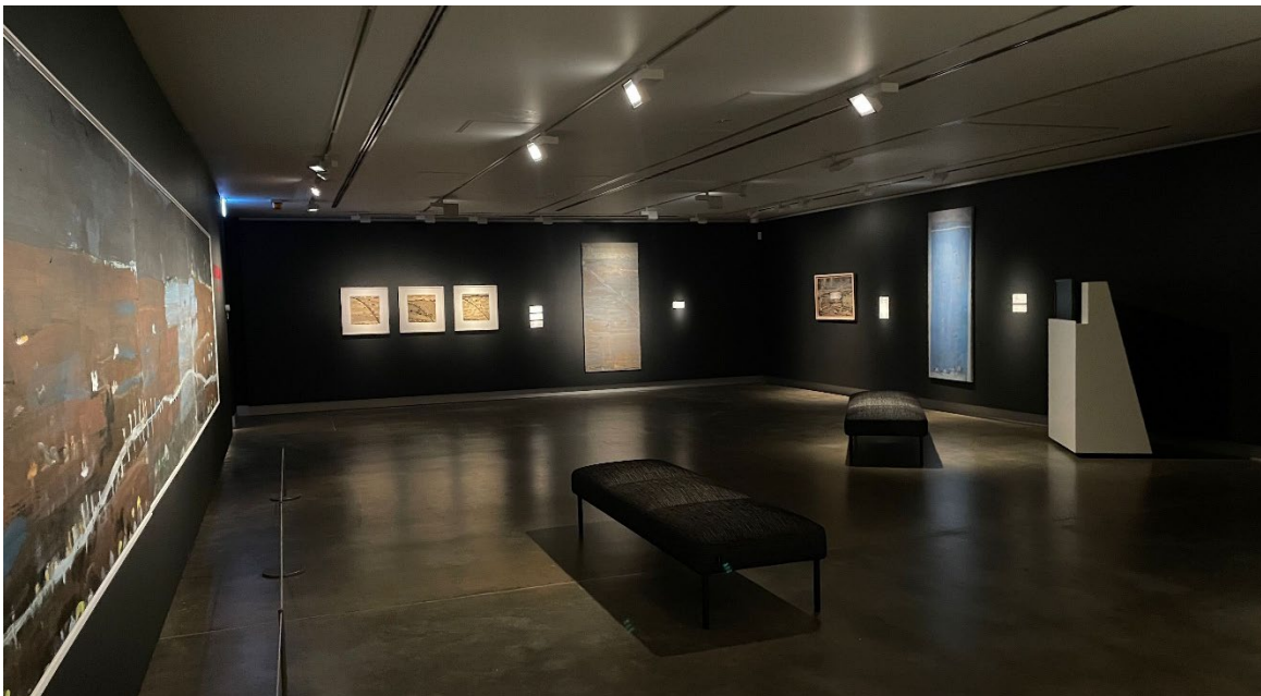
Inside Gallery 3.