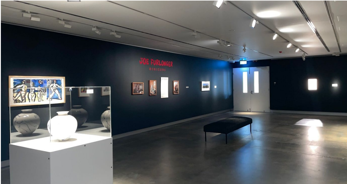
Exhibition Joe Furlonger: Horizons .

These are some photos of what the inside of the gallery looks like, so I can prepare before my visit.