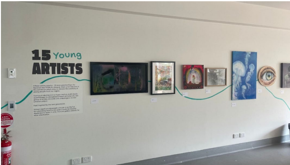
15 Young Artists in the Studio.

This is what the artworks on display look like: