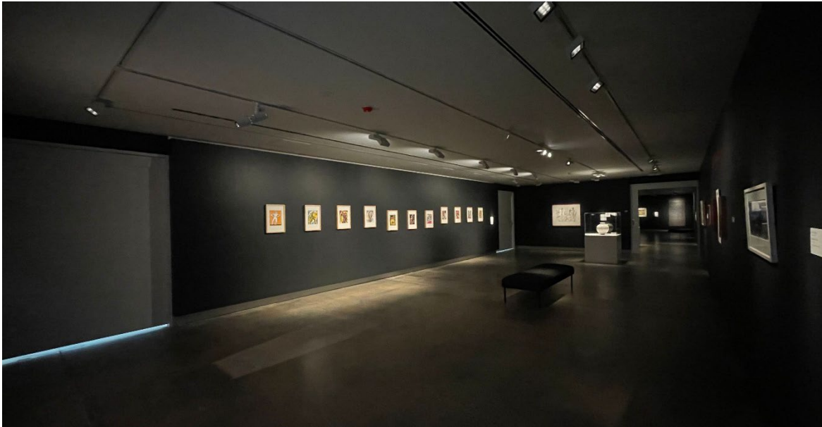
Inside Gallery 4.

Here are some photos of the light levels in the exhibition space: