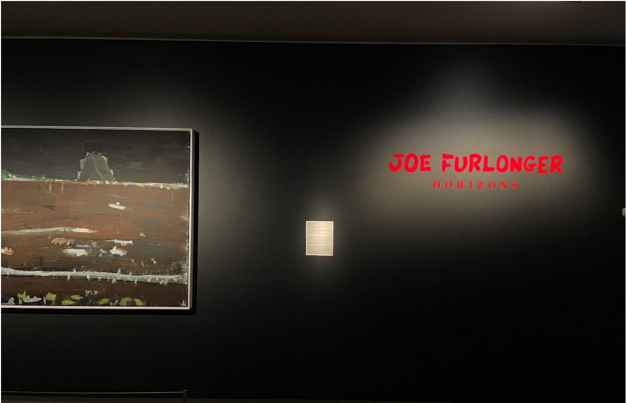
Exhibition Joe Furlonger: Horizons .