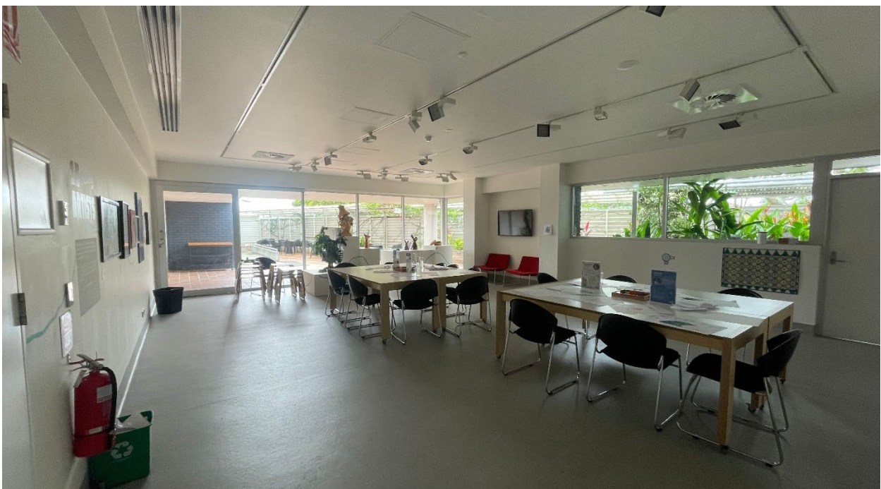
Studio view.

Sometimes the studio is closed for workshops and the activities move to the foyer space. These activities are always available and free. Here is what the studio looks like: