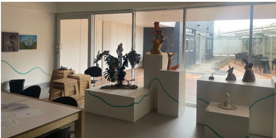
15 Young Artists in the Studio.