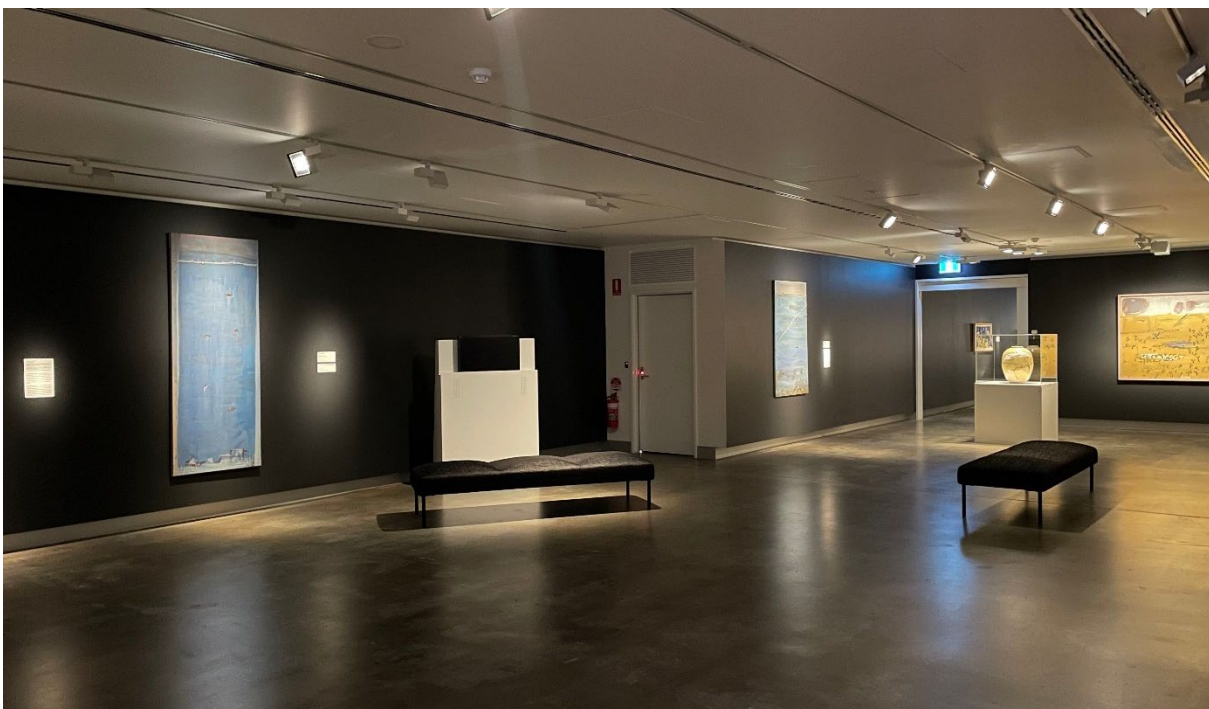
Exhibition Joe Furlonger: Horizons .