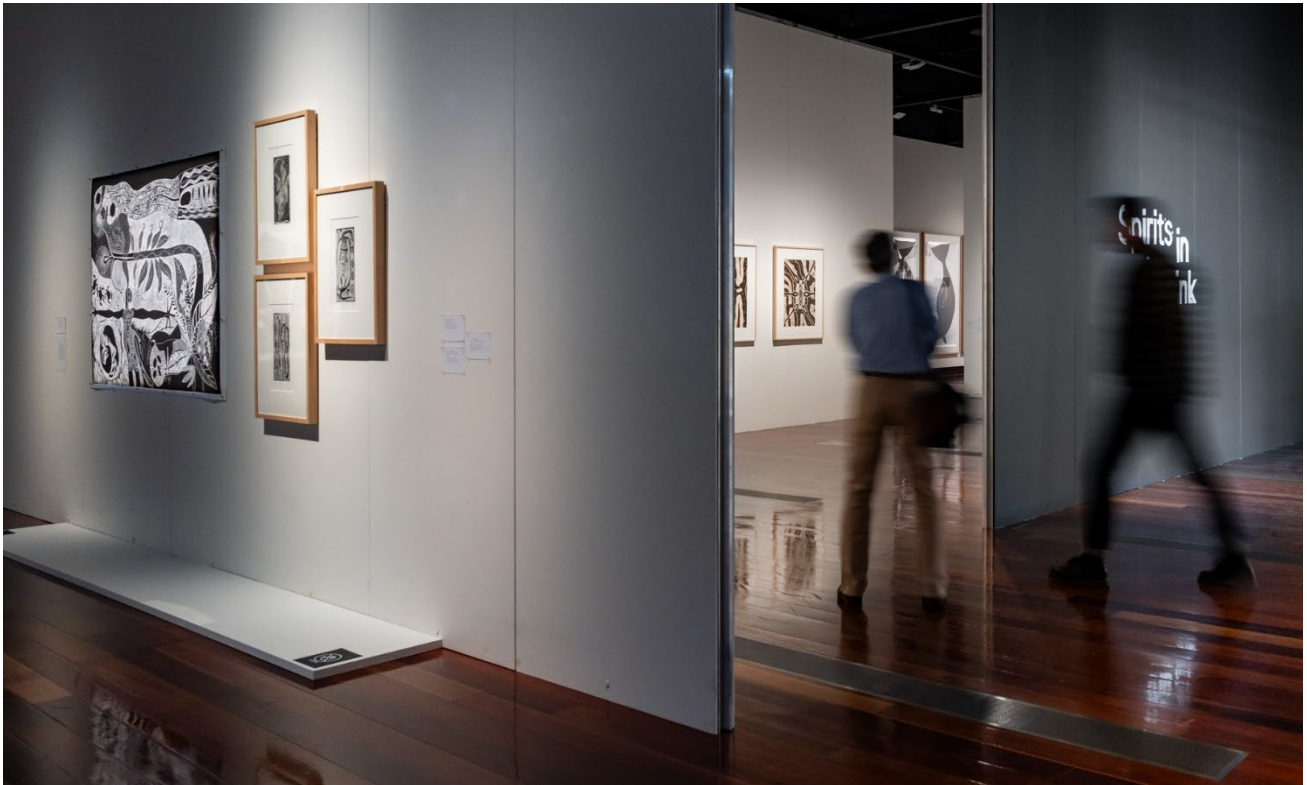
Exhibition Spirits in the Ink .

Through the gallery's glass sliding doors, I will find myself in a large exhibition space. The main gallery has one large exhibition space that changes layout for each exhibition. It is a big space with a wooden floor that looks like this.