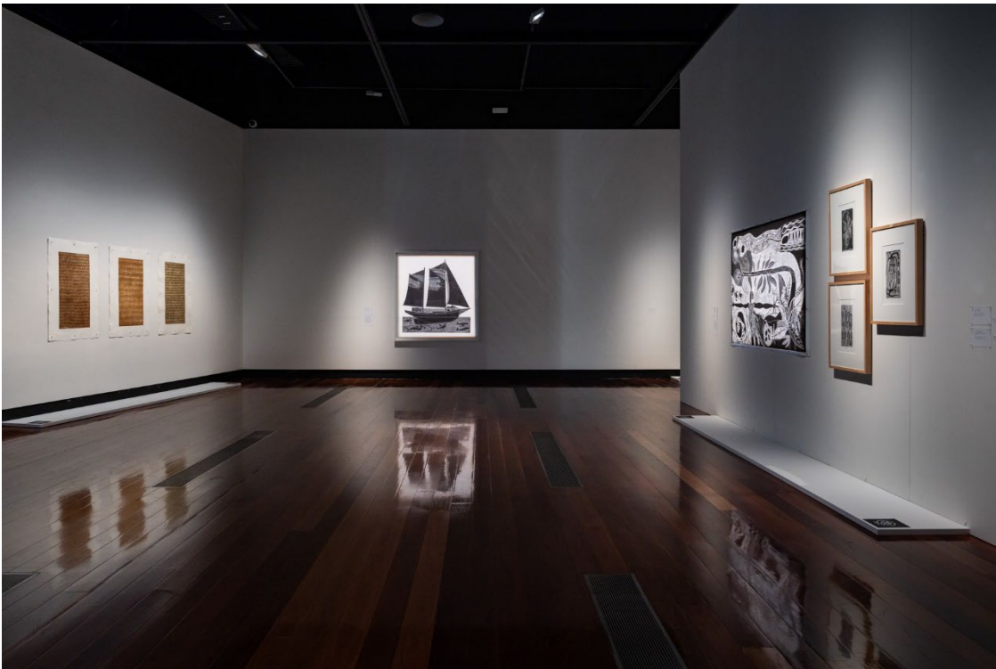
Exhibition Spirits in the Ink .

These are some photos of what the inside of the gallery looks like, so I can prepare before my visit.