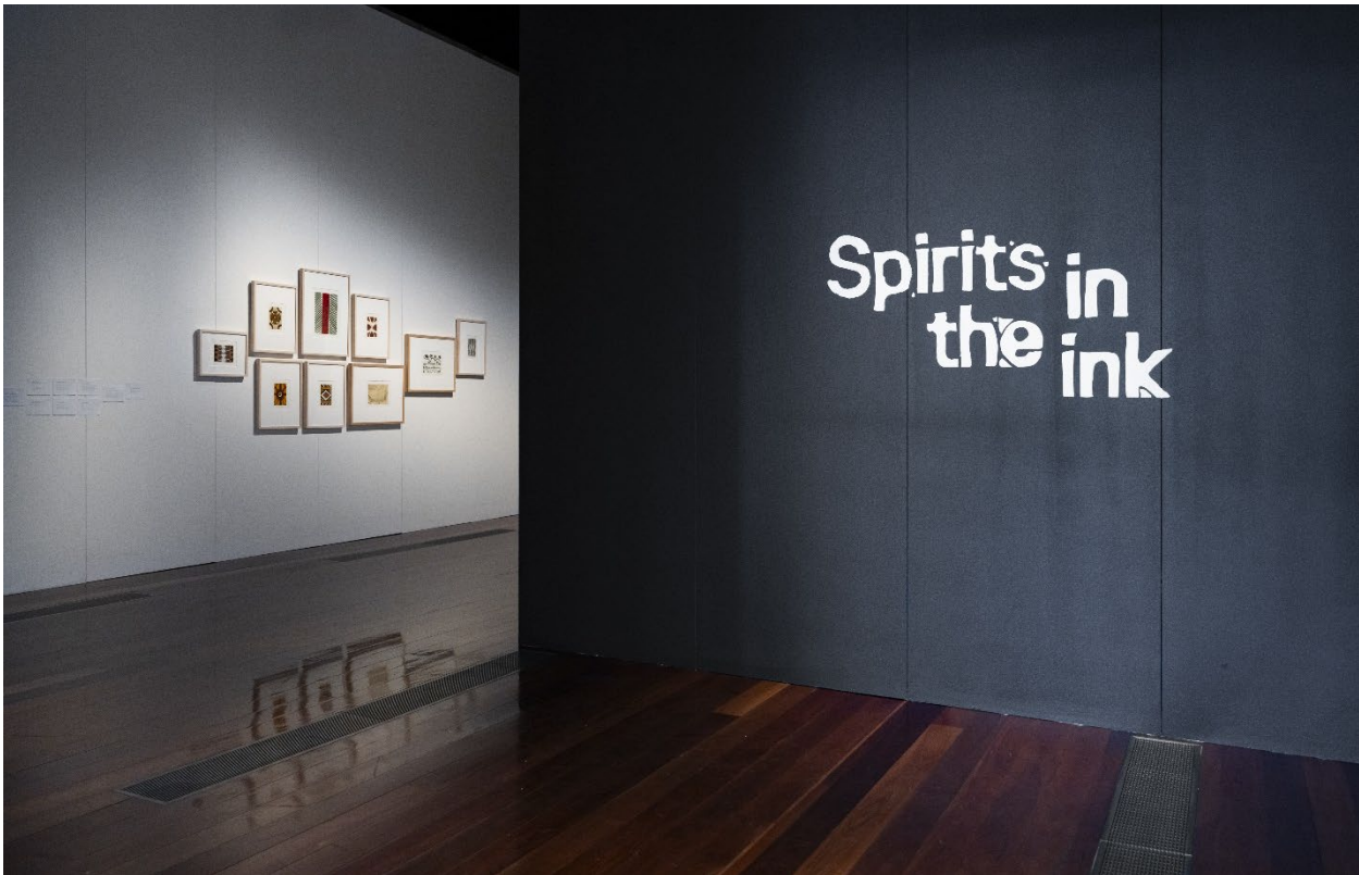
Inside Caboolture Art Gallery. Exhibition Spirits in the Ink .