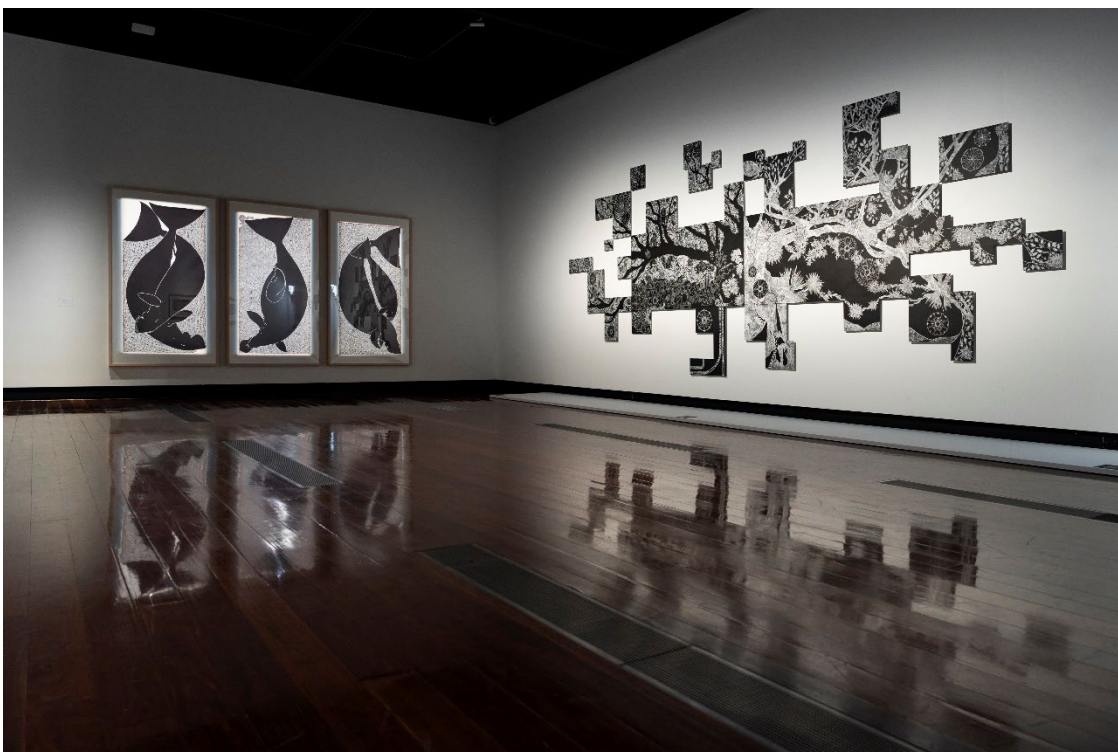
Exhibition Spirits in the Ink .