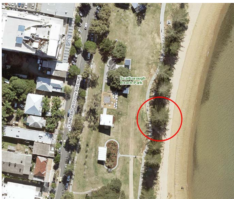
Figure 1: Locality plan - Norfolk Pine Christmas Tree, Scarborough Beach Park, Scarborough

Scarborough Lights Redcliffe Inc. is a community organisation that is undertaking a Christmas tree project. The project involves installing lights to a Norfolk Pine tree at Scarborough Beach Park (refer Figure 1 below) to create a Christmas tree that will be the focus of Christmas celebrations for residents and will attract many visitors to the region over the Christmas/New Year holiday period.