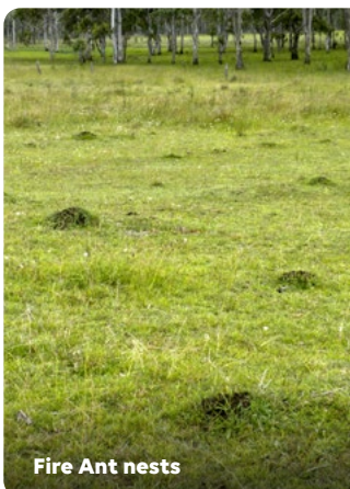
Fire Ant nests