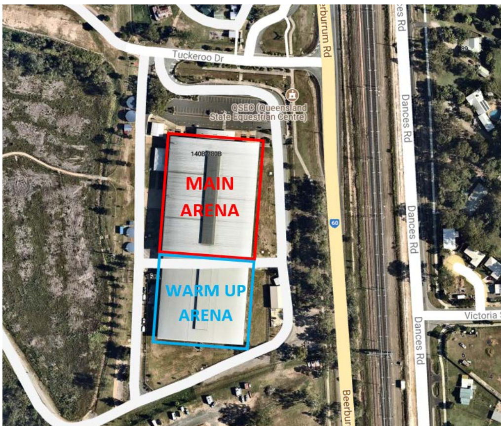
Figure 1 - Location of Main Arena

The project will provide a new arena surface that is compatible with the recently constructed warm up arena and provide a surface that is suitable for general use and competitions.