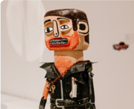
Frank Grohier, Max Rockatansky , 2023. Black wattle, flattened baked bean tins, sheet aluminium, etch primer, nails, artist acrylic and found objects.