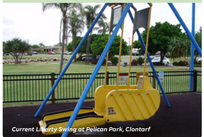
Current Liberty Swing at Pelican Park, Clontarf

Learn more, subscribe for updates, or read the Community Engagement Summary Report: yoursay.moretonbay.qld.gov.au/all-abilities-swing-upgrade-clontarf