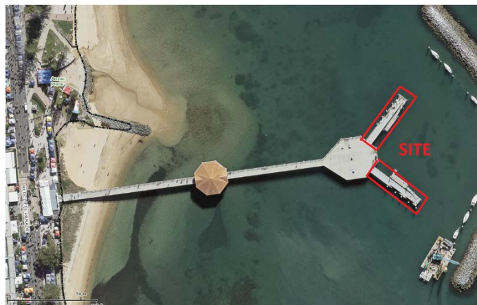
Figure 1: Redcliffe Jetty Finger and Pontoon works location

These works will not affect any jetty activity during the whale watching season, which commences in June 2020. The jetty itself will remain open during the on-site works. To complete the works, there will be a partial closure of the fingers and pontoon whilst the on-site installation of the additional fender piles/pontoon are constructed.