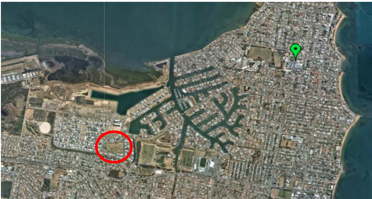
Figure 1 Locality Plan

Newport Park is an established District Park, located between the established Newport community and the emerging Isles of Newport development at Scarborough (refer Figure 1).