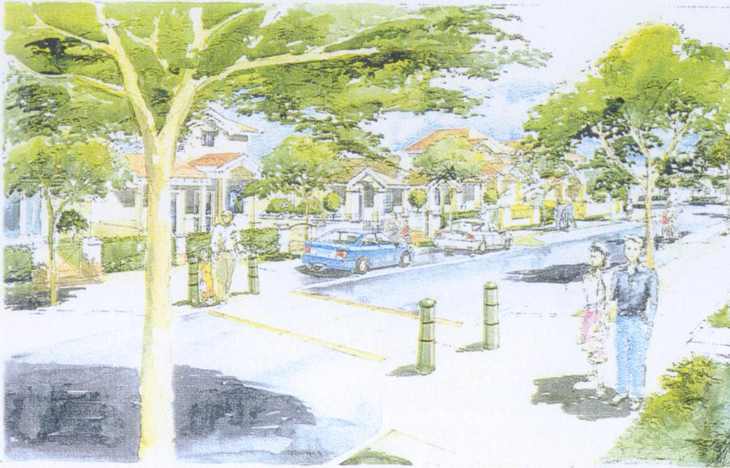
REAR LANE HOUSING FRONTING VILLAGE PARK