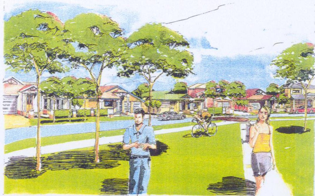
VILLA AND COURTYARD HOUSING FRONTING A LOCAL PARK